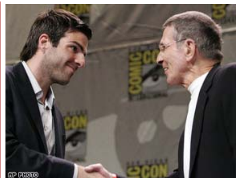
Zachary Quinto, who will play the young Spock in the new "Star Trek," shakes Leonard Nimoy's hand.

Abrams said the movie will go into production in November. "The exciting thing for us, I think, is the ability to take this amazing world that Gene Roddenberry