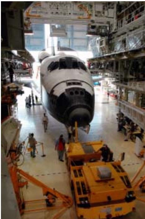
Image above: The orbiter Endeavour is maneuvered into the Orbiter Processing Facility at NASA's Kennedy Space Center in Florida after its return to Earth on Aug. 21. It will undergo post-flight inspections and processing for its next mission.

Endeavour lifted off from Launch Pad 39A on Aug. 8, 2007, following a smooth countdown. The STS-118 mission was the 22nd flight to the International Space Station and Endeavour 's first flight since 2002.