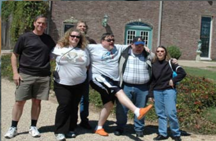
Region 3 Kicks up their Heels at Regional Retreat

INSIDE A ARC REPORT A STAFF REPORTS A VESSEL REPORTS A REGIONAL NEWS