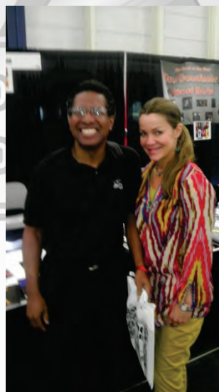
13 Robert Graham and Claudia Christian from Babylon 5

As we all reach the halfway point of 2012, its has been a busy year for the USS SpiritWolf.