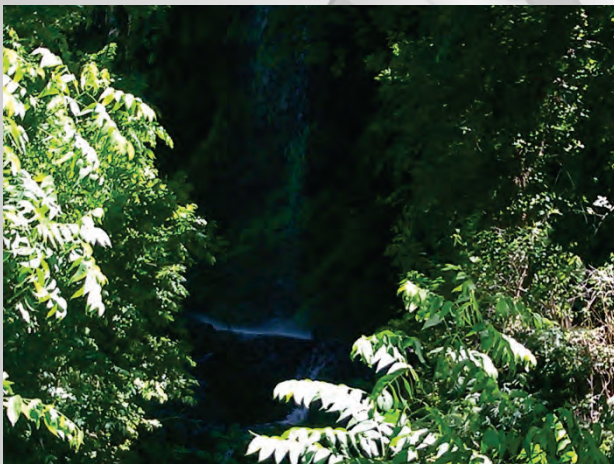
6 View of Gorman Falls. Need to see it in person!

No matter how offensive we were to our olfactory senses, it was well worth it when we saw the Gorman Falls. They were so beautiful!