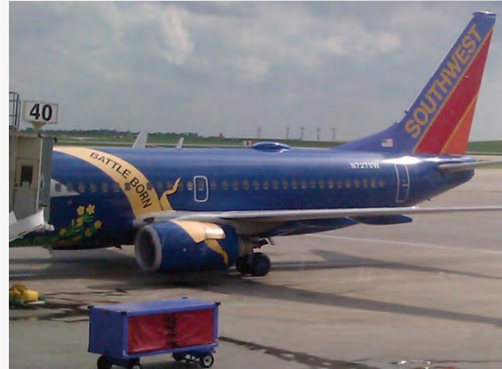
3 Battle Born One from Southwest Airlines.

As a side note for April and May, on the way home from a little work trip I had to take immediate after R12's Summit, I had the opportunity to see an interesting site at the Kansas City International Airport, a plane named the USS Battle Born.