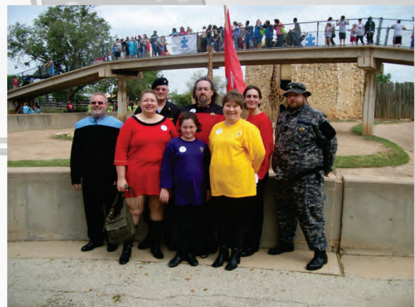
8 The crew of the USS Diamondback.

The USS Diamondback crew has had a busy spring. We participated in the Walk for Autism Speaks at the Abilene Zoo in April. We had a lot of fun and it gave our ship a lot of good recognition in the Abilene community.