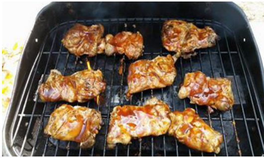
Things are really cooking in Zone 2!

First of all, let me recap a little about myself. I am just your ordinary fun loving guy. Okay, yes, I wear a skant to conventions and get a lot of pictures taken of me