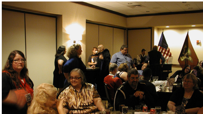
Region 3 Saturday Night Dinner