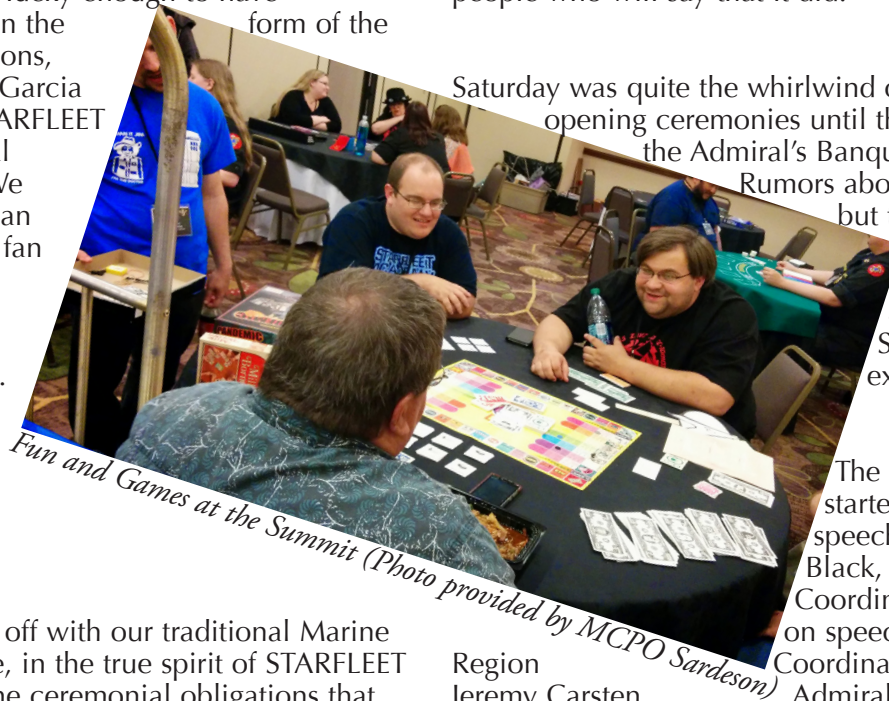
Fun and Games at the Summit