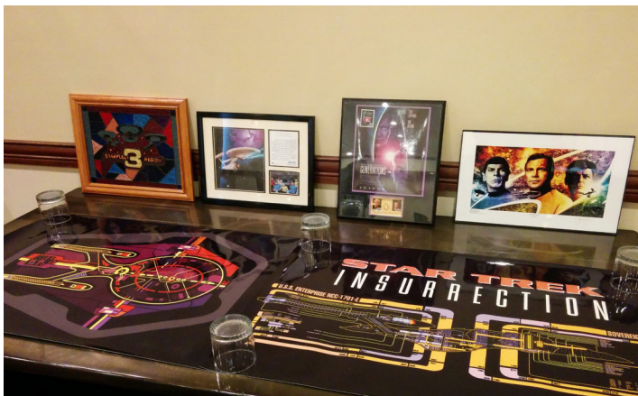
Items up for bid at the Summit Auction